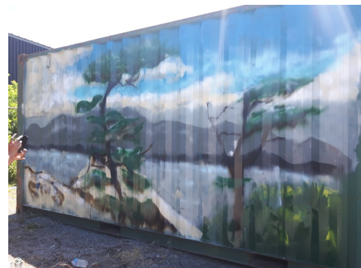
St. Catharines beautifully painted sea containers