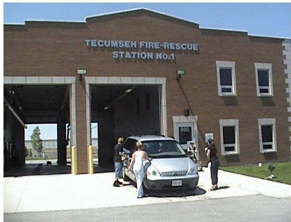
Above: Windsor /Essex Youth Doing a Car Wash