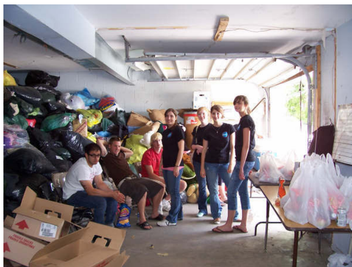
Right> Kitchener –Waterloo Youth taking a break.