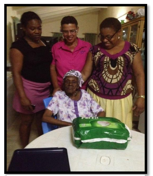
Delivering pampers package to a shut-in

As a member of the St. Francis of Assisi Conference, my view of the island took on a different outlook as the other members and myself engaged in weekly house to house visitations. We encountered people living in dire