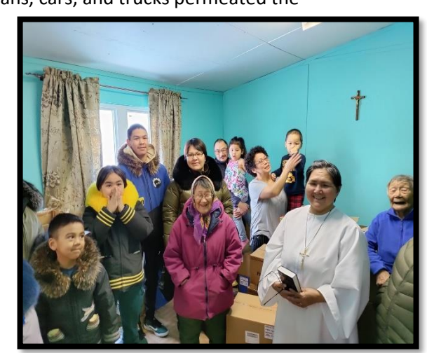
Sharing in the Joy of the Seacan's arrival in Coral Harbour

The charged atmosphere, the ringing church bells, and the chatter added to an incredible feeling of elation, camaraderie, and hope for a safe journey to Coral Harbour. The seacan would soon leave Stoney Creek for trucking to Montreal, where it would be loaded on a ship, and transferred to a barge near the coast of Coral Harbour. The shipment was scheduled to arrive October 24. However, due to the weather elements of wind, snow, and lack of ice to calm the rough waters of Hudson Bay, the ship was detoured to a community much further north and finally arrived on the shores of Coral Harbour on the 8<sup>th</sup> of November. The photo (right) shows a happy group of