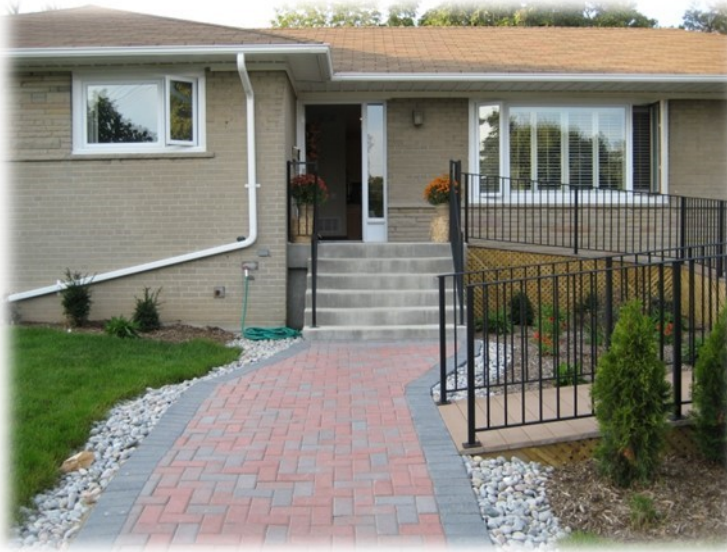
De Paul House

that some individuals simply need low supports in order to retain a level of functional independence.